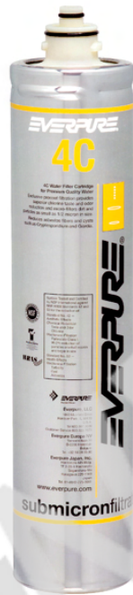
4C Replacement Cartridge: EV9600-00 (1-pack) EV9601-00 (6-pack)

Delivers premium quality water for cold cup vending applications